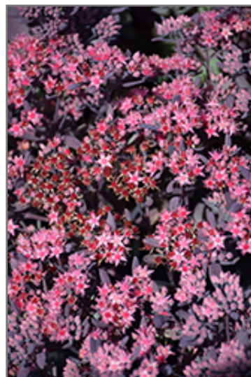
Plum Dazzled Stonecrop flowers

Plum Dazzled Stonecrop is a dense herbaceous perennial with an upright spreading habit of growth. Its medium texture blends into the garden, but can always be balanced by a couple of finer or coarser plants for an effective composition.