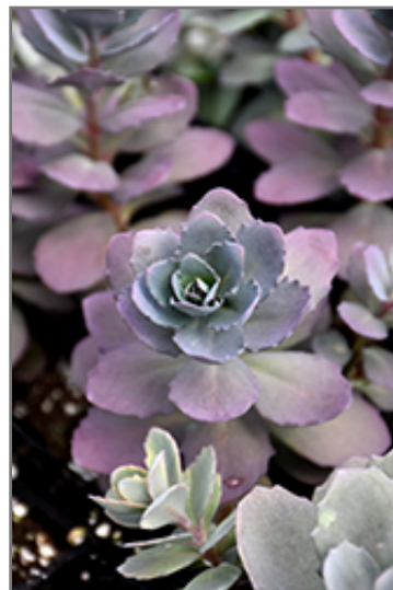
Plum Dazzled Stonecrop foliage