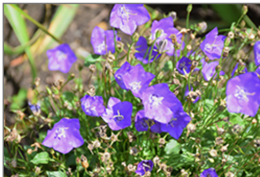
Violet Teacups Bellflower flowers