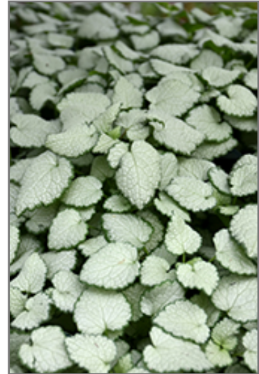
Red Nancy Spotted Dead Nettle foliage

Red Nancy Spotted Dead Nettle is a fine choice for the garden, but it is also a good selection for planting in outdoor pots and containers. Because of its spreading habit of growth, it is ideally suited for use as a 'spiller' in the 'spiller-thriller-filler' container combination; plant it near the edges where it can spill gracefully over the pot. Note that when growing plants in outdoor containers and baskets, they may require more frequent waterings than they would in the yard or garden.