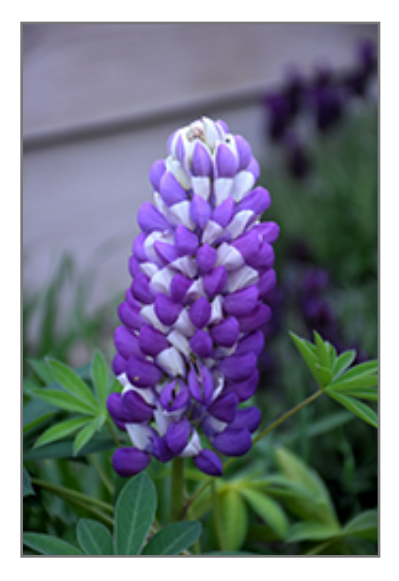
Mini Gallery Blue Bicolor Lupine flowers