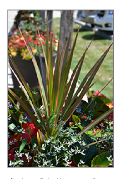
Cordylena Ruby Madagascar Dragon Tree flowers

When grown indoors, Cordylena Ruby Madagascar Dragon Tree can be expected to grow to be about 4 feet tall at maturity, with a spread of 24 inches. It grows at a medium rate, and under ideal conditions can be expected to live for approximately 10 years. This houseplant will do well in a location that gets either direct or indirect sunlight, although it will usually require a more brightly-lit environment than what artificial indoor lighting alone can provide. It does best in average to evenly moist soil, but will not tolerate standing water. The surface of the soil shouldn't be allowed to dry out completely, and so you should expect to water this plant once and possibly even twice each week. Be aware that your particular watering schedule may vary depending on its location in the room, the pot size, plant size and other conditions; if in doubt, ask one of our experts in the store for advice. It is not particular as to soil type or pH; an average potting soil should work just fine.