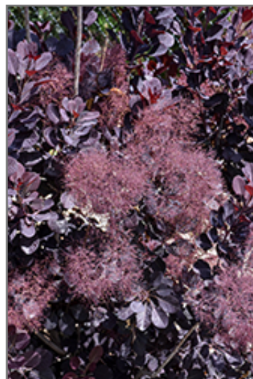
Velveteeny Purple Smokebush flowers