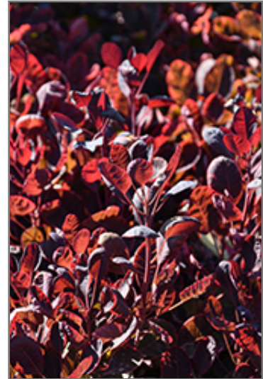
Velveteeny Purple Smokebush foliage

Velveteeny Purple Smokebush makes a fine choice for the outdoor landscape, but it is also well-suited for use in outdoor pots and containers. With its upright habit of growth, it is best suited for use as a 'thriller' in the 'spiller-thriller-filler' container combination; plant it near the center of the pot, surrounded by smaller plants and those that spill over the edges. It is even sizeable enough that it can be grown alone in a suitable container. Note that when grown in a container, it may not perform exactly as indicated on the tag - this is to be expected. Also note that when growing plants in outdoor containers and baskets, they may require more frequent waterings than they would in the yard or garden.