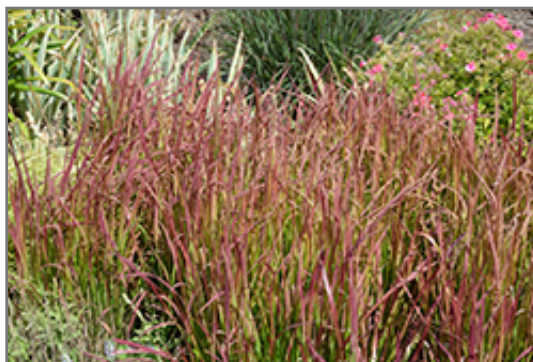
Red Baron Japanese Blood Grass

Red Baron Japanese Blood Grass will grow to be about 20 inches tall at maturity, with a spread of 18 inches. It grows at a slow rate, and under ideal conditions can be expected to live for approximately 20 years. As an herbaceous perennial, this plant will usually die back to the crown each winter, and will regrow from the base each spring. Be careful not to disturb the crown in late winter when it may not be readily seen!