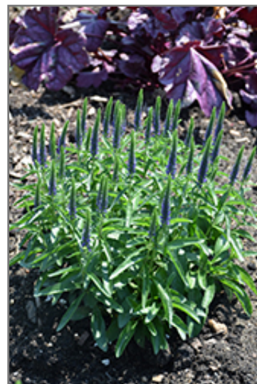
Magic Show Wizard of Ahhs Speedwell in bloom

Magic Show Wizard of Ahhs Speedwell is a fine choice for the garden, but it is also a good selection for planting in outdoor pots and containers. It is often used as a 'filler' in the 'spiller-thriller-filler' container combination, providing a mass of flowers against which the larger thriller plants stand out. Note that when growing plants in outdoor containers and baskets, they may require more frequent waterings than they would in the yard or garden.