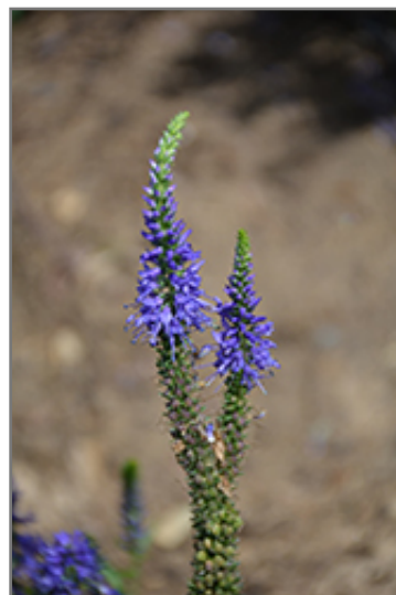
Magic Show Wizard of Ahhs Speedwell flowers