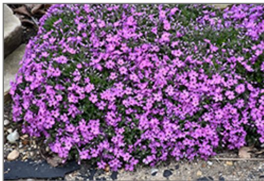
Rocky Road Pink Phlox in bloom