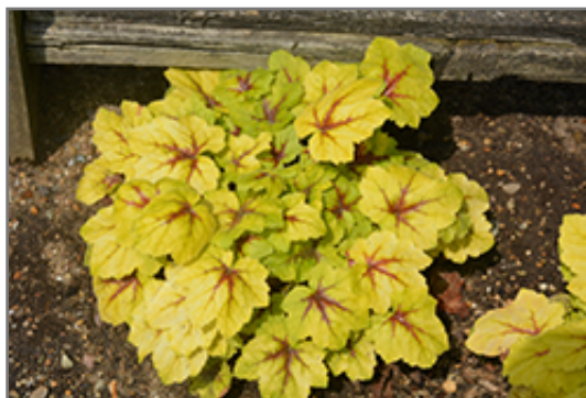
Catching Fire Foamy Bells

This is a relatively low maintenance plant, and should be cut back in late fall in preparation for winter. It is a good choice for attracting hummingbirds to your yard. It has no significant negative characteristics.