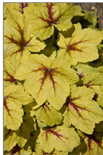
Catching Fire Foamy Bells foliage