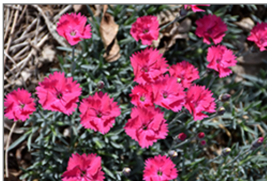
Paint The Town Magenta Pinks flowers