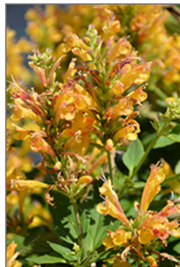
Poquito Butter Yellow Hyssop flowers

Poquito Butter Yellow Hyssop is recommended for the following landscape applications;