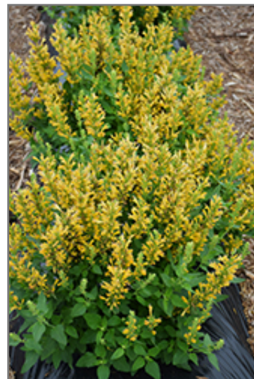
Poquito Butter Yellow Hyssop in bloom