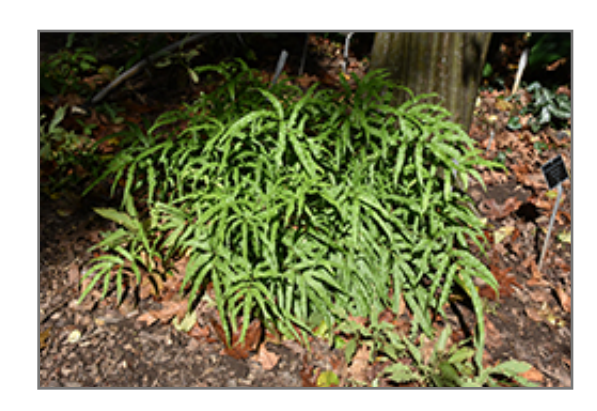
Hardy Ribbon Fern