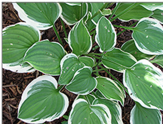
Diamond Tiara Hosta foliage

Diamond Tiara Hosta will grow to be about 12 inches tall at maturity extending to 18 inches tall with the flowers, with a spread of 24 inches. When grown in masses or used as a bedding plant, individual plants should be spaced approximately 20 inches apart. Its foliage tends to remain dense right to the ground, not requiring facer plants in front. It grows at a medium rate, and under ideal conditions can be expected to live for approximately 10 years. As an herbaceous perennial, this plant will usually die back to the crown each winter, and will regrow from the base each spring. Be careful not to disturb the crown in late winter when it may not be readily seen!