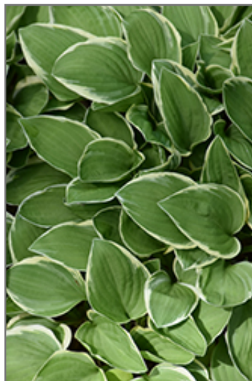
Diamond Tiara Hosta foliage