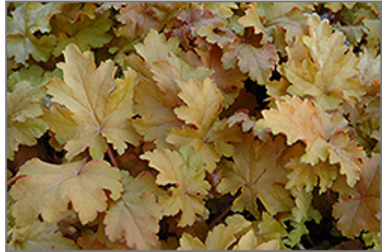
Amber Waves Coral Bells foliage

Amber Waves Coral Bells is a fine choice for the garden, but it is also a good selection for planting in outdoor pots and containers. It is often used as a 'filler' in the 'spiller-thriller-filler' container combination, providing a mass of flowers and foliage against which the larger thriller plants stand out. Note that when growing plants in outdoor containers and baskets, they may require more frequent waterings than they would in the yard or garden.