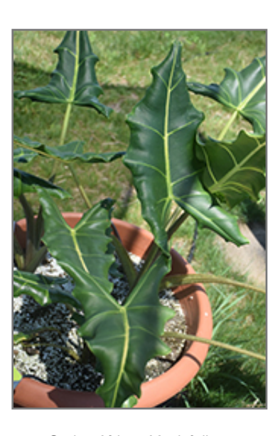
Sarian African Mask foliage

When grown indoors, Sarian African Mask can be expected to grow to be about 6 feet tall at maturity, with a spread of 4 feet. It grows at a medium rate, and under ideal conditions can be expected to live for approximately 5 years. This houseplant will do well in a location that gets either direct or indirect sunlight, although it will usually require a more brightly-lit environment than what artificial indoor lighting alone can provide. It is quite adaptable, prefering to grow in average to wet conditions, and will even tolerate some standing water. The surface of the soil should be kept consistently moist all of the time, and you should expect to water this plant two or more times each week, especially if it's growing in a low-humidity environment. Be aware that your particular watering schedule may vary depending on its location in the room, the pot size, plant size and other conditions; if in doubt, ask one of our experts in the store for advice. It is not particular as to soil type or pH; an average potting soil should work just fine. Be warned that parts of this plant are known to be toxic to humans and animals, so special care should be exercised if growing it around children and pets.