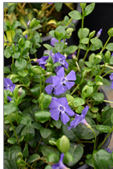
Bowles Cunningham Periwinkle flowers