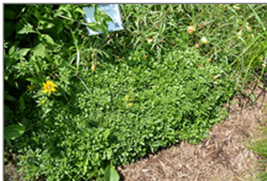
Czar's Gold Stonecrop