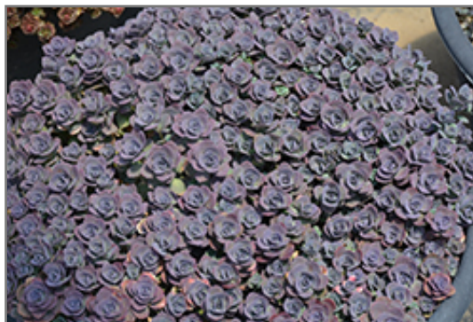
SunSparkler Blue Elf Sedoro