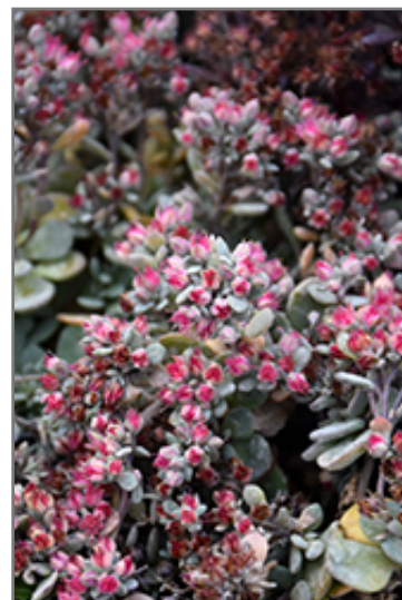
SunSparkler Blue Elf Sedoro flowers

SunSparkler Blue Elf Sedoro is a dense herbaceous perennial with a ground-hugging habit of growth. Its relatively fine texture sets it apart from other garden plants with less refined foliage.