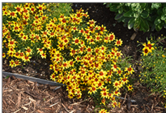
Sizzle And Spice Curry Up Tickseed in bloom