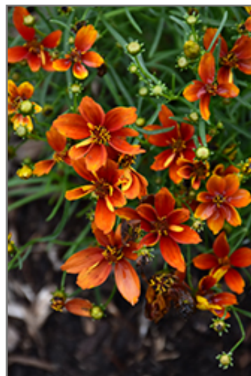
Sizzle And Spice Crazy Cayenne Tickseed flowers

Sizzle And Spice Crazy Cayenne Tickseed is recommended for the following landscape applications;