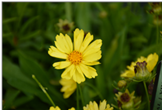
Leading Lady Sophia Tickseed flowers

Leading Lady Sophia Tickseed is recommended for the following landscape applications;