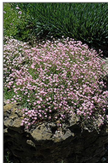
Pink Creeping Baby's Breath in bloom