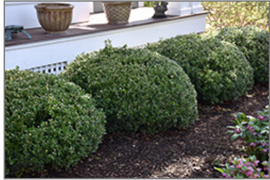
Sprinter Boxwood

Sprinter Boxwood will grow to be about 4 feet tall at maturity, with a spread of 4 feet. It tends to fill out right to the ground and therefore doesn't necessarily require facer plants in front. It grows at a fast rate, and under ideal conditions can be expected to live for approximately 30 years.