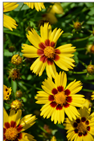
Sunkiss Tickseed flowers