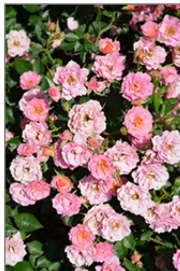
Oso Easy Petit Pink flowers