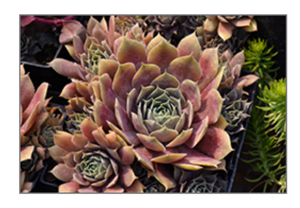
Silverine Hens And Chicks

When grown indoors, Silverine Hens And Chicks can be expected to grow to be only 4 inches tall at maturity extending to 12 inches tall with the flowers, with a spread of 12 inches. It grows at a medium rate, and under ideal conditions can be expected to live for approximately 20 years. This houseplant requires direct sun for optimal performance, and should therefore be situated in a room that gets bright sunlight for a good part of the day; it is not a good choice for rooms lit only by artificial light. It prefers dry to average moisture levels with very well-drained soil, and may die if left in standing water for any length of time. This plant should be watered when the surface of the soil gets dry, and will need watering approximately once each week. Be aware that your particular watering schedule may vary depending on its location in the room, the pot size, plant size and other conditions; if in doubt, ask one of our experts in the store for advice. It is not particular as to soil pH, but grows best in sandy soil. Contact the store for specific recommendations on pre-mixed potting soil for this plant.