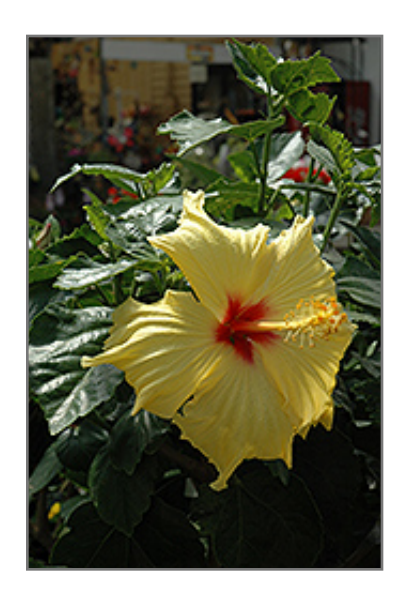
Hula Girl Hibiscus flowers

When grown indoors, Hula Girl Hibiscus can be expected to grow to be about 5 feet tall at maturity, with a spread of 4 feet. It grows at a fast rate, and under ideal conditions can be expected to live for approximately 5 years. This houseplant will do well in a location that gets either direct or indirect sunlight, although it will usually require a more brightly-lit environment than what artificial indoor lighting alone can provide. It requires an evenly moist well-drained soil for optimal growth, but will suffer if left to grow in standing water. The surface of the soil shouldn't be allowed to dry out completely, and so you should expect to water this plant once and possibly even twice each week. Be aware that your particular watering schedule may vary depending on its location in the room, the pot size, plant size and other conditions; if in doubt, ask one of our experts in the store for advice. It is not particular as to soil type or pH; an average potting soil should work just fine.