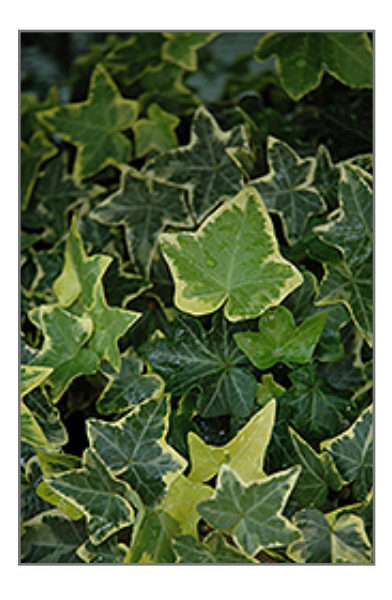
Gold Child Ivy foliage

When grown indoors, Gold Child Ivy can be expected to grow to be about 10 feet tall at maturity, with a spread of 3 feet. It grows at a medium rate, and under ideal conditions can be expected to live for approximately 30 years. This houseplant performs well in both bright or indirect sunlight and strong artificial light, and can therefore be situated in almost any well-lit room or location. It prefers to grow in average to moist soil. The surface of the soil shouldn't be allowed to dry out completely, and so you should expect to water this plant once and possibly even twice each week. Be aware that your particular watering schedule may vary depending on its location in the room, the pot size, plant size and other conditions; if in doubt, ask one of our experts in the store for advice. It is not particular as to soil pH, but grows best in rich soil. Contact the store for specific recommendations on pre-mixed potting soil for this plant. Be warned that parts of this plant are known to be toxic to humans and animals, so special care should be exercised if growing it around children and pets.