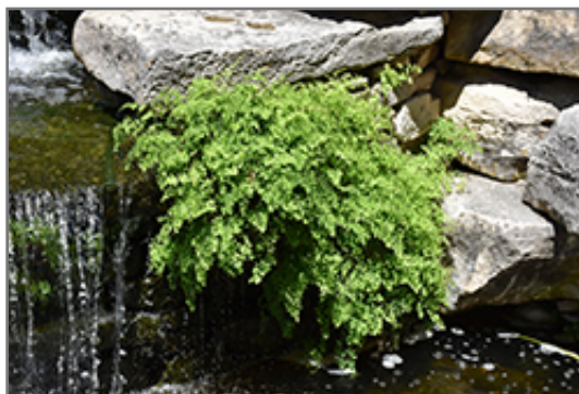
Southern Maidenhair Fern

This is an herbaceous houseplant with a shapely form and gracefully arching foliage. Its extremely fine and delicate texture is quite ornamental and should be used to full effect. This plant usually looks its best without pruning, although it will tolerate pruning.