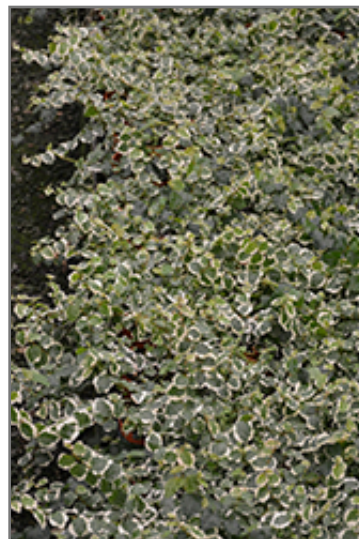
Variegated Creeping Fig in full