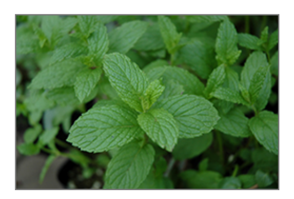
The Best Spearmint foliage