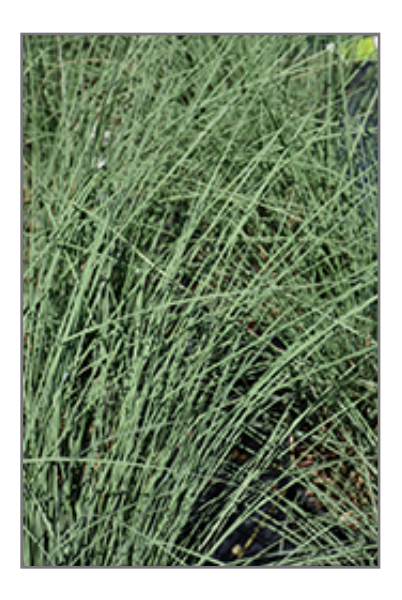
Pink Flamingo Muhly Grass foliage

Pink Flamingo Muhly Grass is a fine choice for the garden, but it is also a good selection for planting in outdoor pots and containers. Because of its height, it is often used as a 'thriller' in the 'spiller-thriller-filler' container combination; plant it near the center of the pot, surrounded by smaller plants and those that spill over the edges. It is even sizeable enough that it can be grown alone in a suitable container. Note that when growing plants in outdoor containers and baskets, they may require more frequent waterings than they would in the yard or garden.