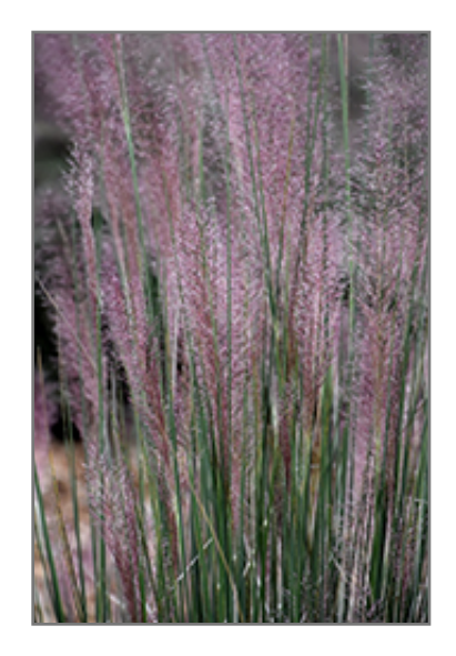
Pink Flamingo Muhly Grass fruit