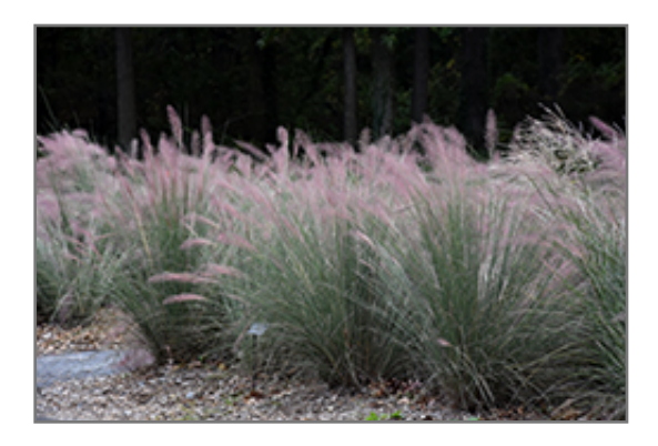
Pink Flamingo Muhly Grass fruit

This is a relatively low maintenance plant, and is best cleaned up in early spring before it resumes active growth for the season. Deer don't particularly care for this plant and will usually leave it alone in favor of tastier treats. It has no significant negative characteristics.