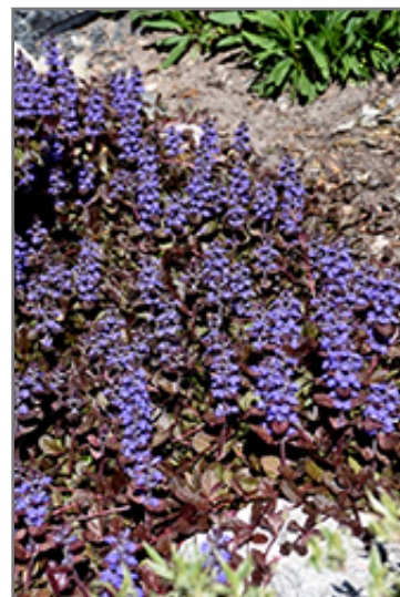
Mahogany Bugleweed flowers

Mahogany Bugleweed is a dense herbaceous evergreen perennial with a ground-hugging habit of growth. Its relatively fine texture sets it apart from other garden plants with less refined foliage.