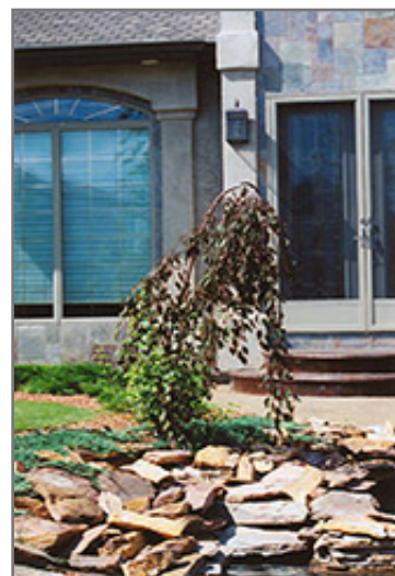
Royal Beauty Flowering Crab