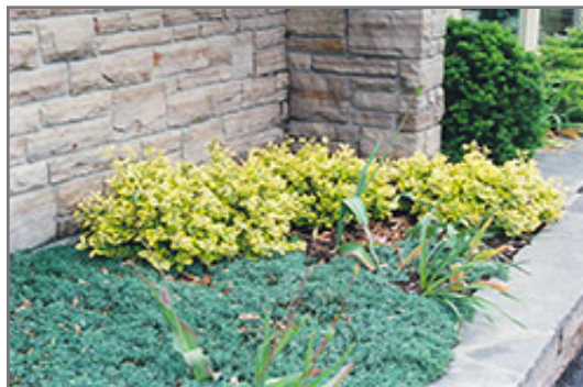
Sungold Wintercreeper