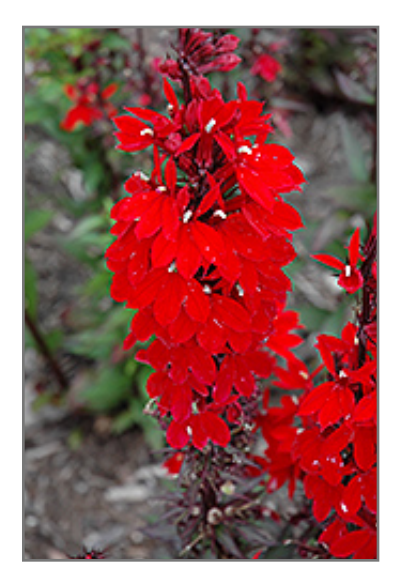
Vulcan Red Lobelia flowers