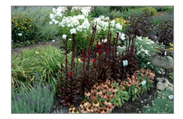
Vulcan Red Lobelia in bloom

363 Governors Rd East Paris Ontario N3L 3E1 T. 519 752 4436 W. www.waltersgreenhouse.ca