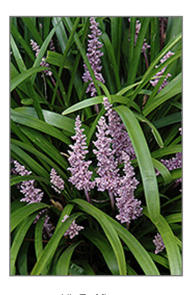
Lily Turf flowers