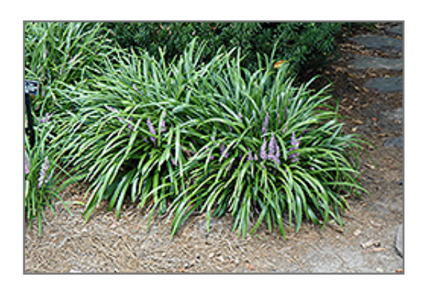
Lily Turf in bloom