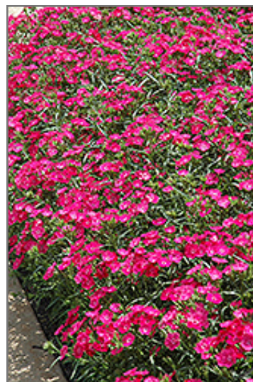
Bouquet Rose Pinks in bloom