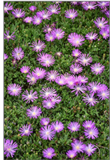
Table Mountain Ice Plant flowers

Table Mountain Ice Plant is a fine choice for the garden, but it is also a good selection for planting in outdoor pots and containers. Because of its spreading habit of growth, it is ideally suited for use as a 'spiller' in the 'spiller-thriller-filler' container combination; plant it near the edges where it can spill gracefully over the pot. Note that when growing plants in outdoor containers and baskets, they may require more frequent waterings than they would in the yard or garden.