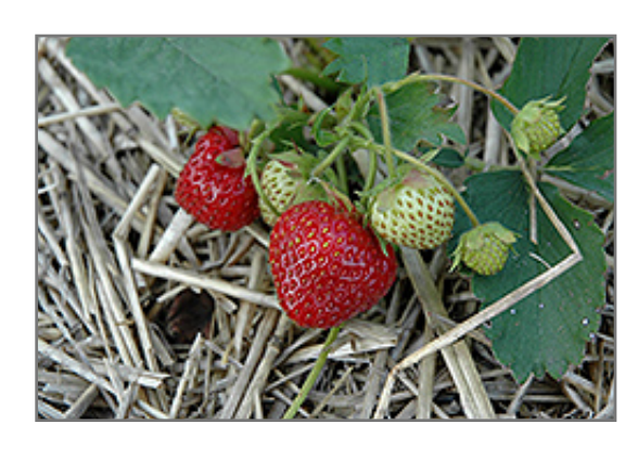
Everest Strawberry fruit