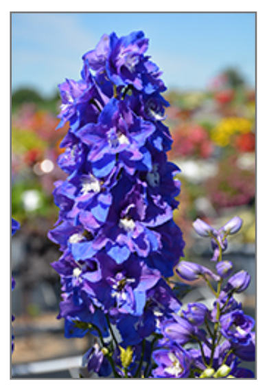
Dasante Blue Larkspur flowers