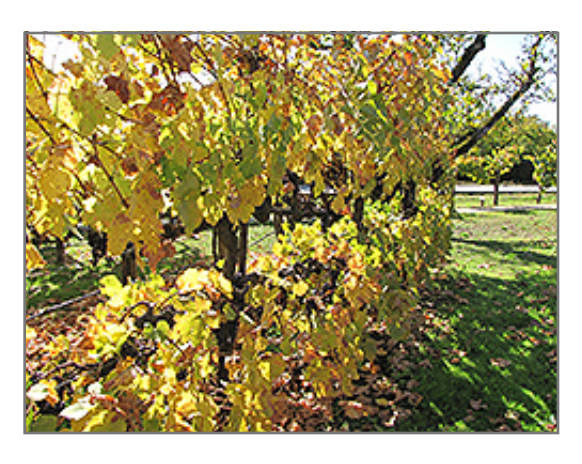
Merlot Grape in fall