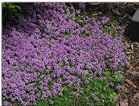
Purple Carpet Creeping Thyme in bloom