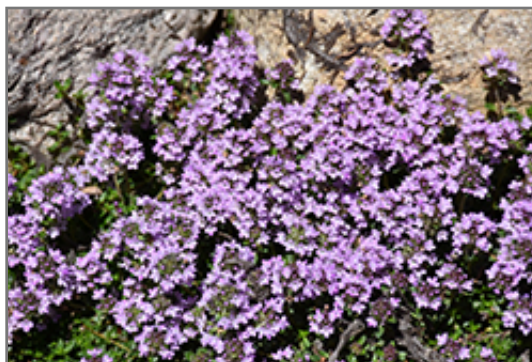
Purple Carpet Creeping Thyme flowers