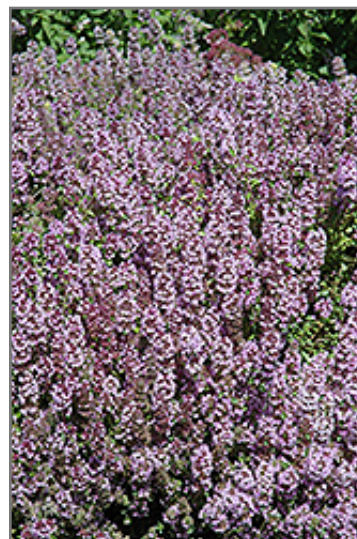
Mother-of-Thyme in bloom