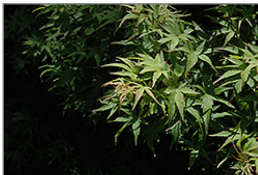
Akita Yatsubusa Japanese Maple foliage