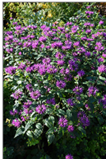
Dark Ponticum Beebalm in bloom