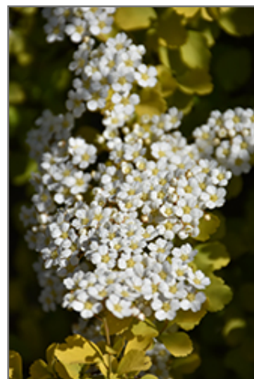
Glow Girl Birch Leaf Spirea flowers