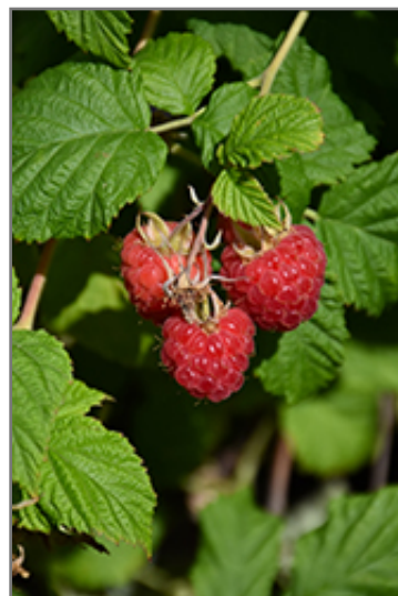
Raspberry Shortcake Raspberry fruit

Raspberry Shortcake Raspberry has rich green deciduous foliage on a plant with an upright spreading habit of growth. The textured oval compound leaves do not develop any appreciable fall colour. It features an abundance of magnificent red berries in mid summer.