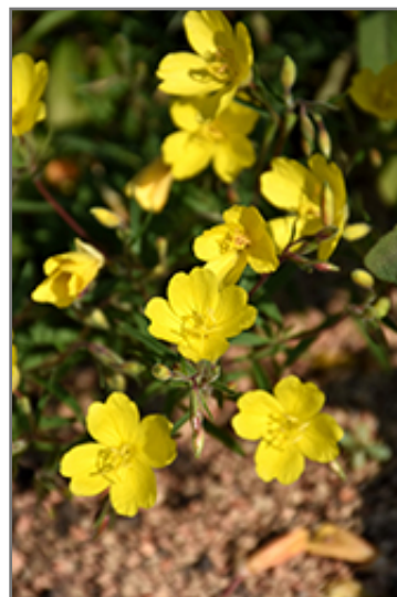
Lemon Drop Primrose flowers

Lemon Drop Primrose is recommended for the following landscape applications;